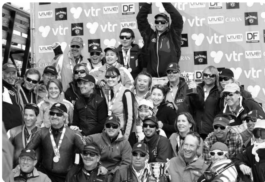
A group of very happy American Masters celebrate winning the Nations Cup at Valle Nevado, Chile, this summer. Victory is sweetest when accomplished with friends.

Hopefully, Northern can have even a bigger contingent of racers this year, with Nationals being at Park City, UT and Western Regionals being at Big Sky, MT. Major